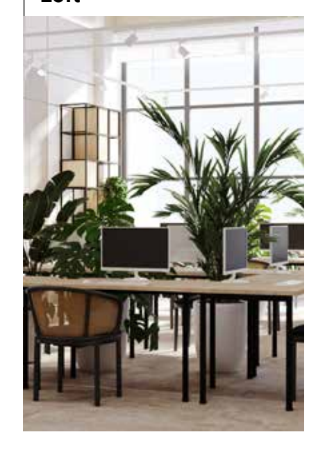
6 to 20 people Loft