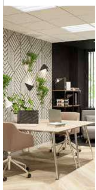
1 to 5 people Studio