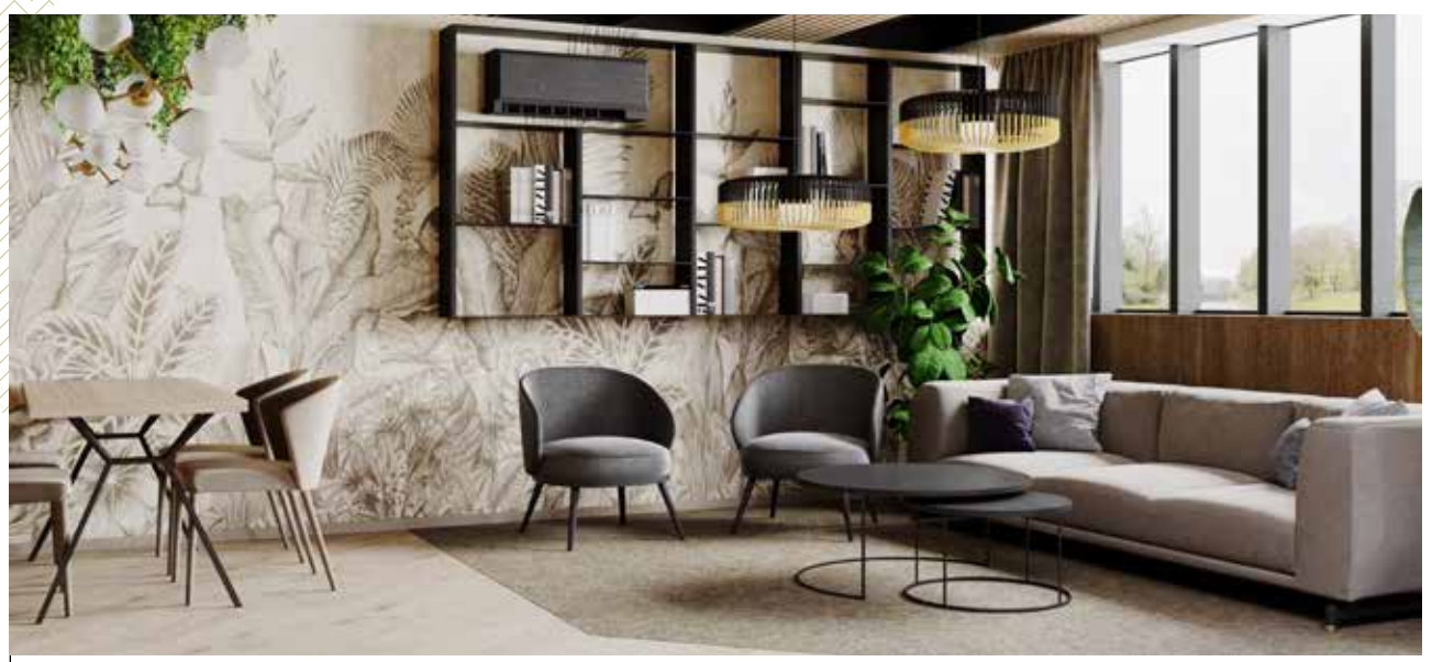
Designer lounges and coffee zones to enhance team working and knowledge sharing