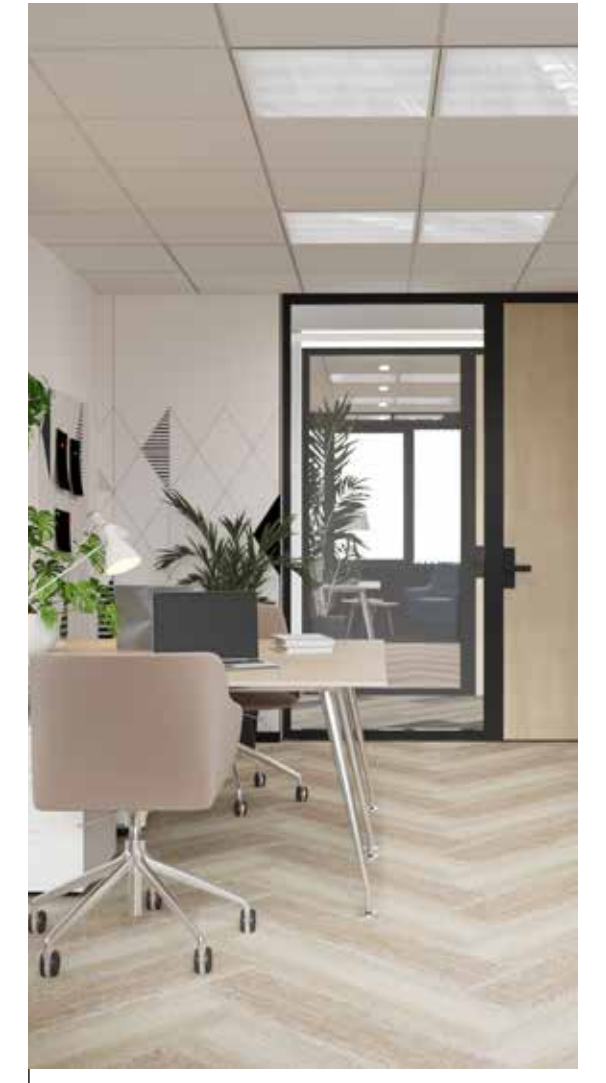
Private offices to work confidentially and comfortably without distractions

Fully equipped meeting room for your meetings, presentations or training