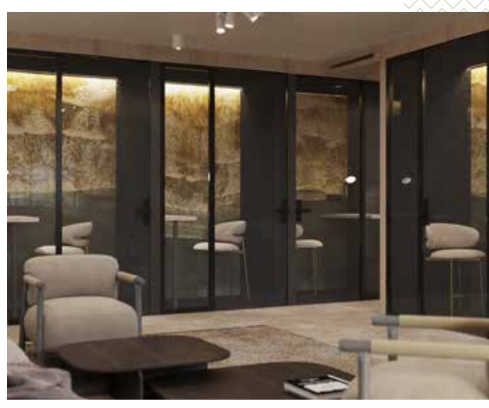
Phone booths to make discreet calls without disturbing colleagues

A lively meet and greet area where you can welcome clients and visitors